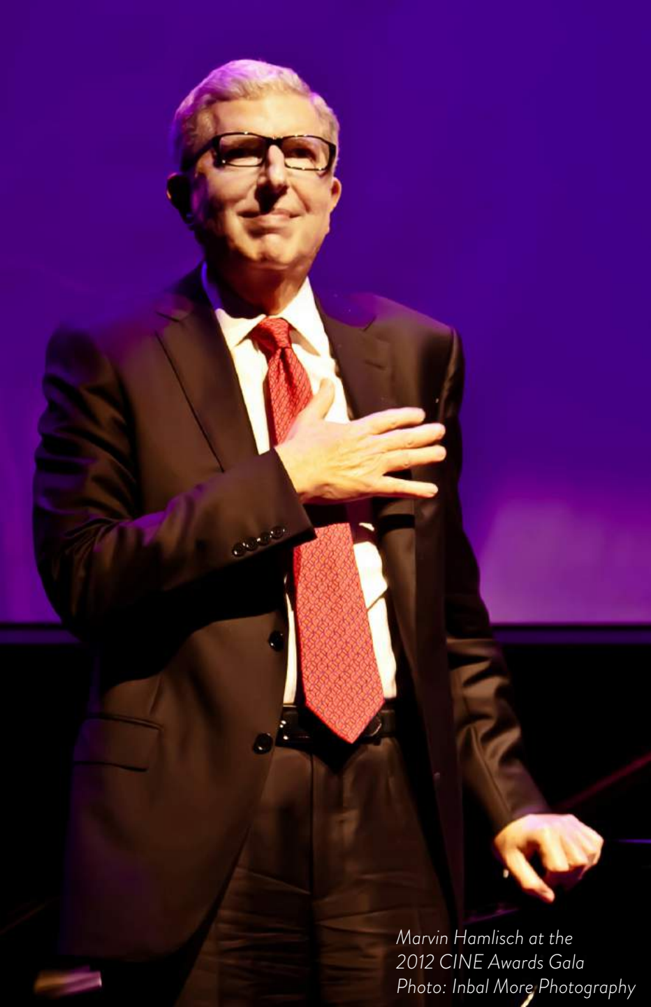
Marvin Hamlisch at the 2012 CINE Awards Gala